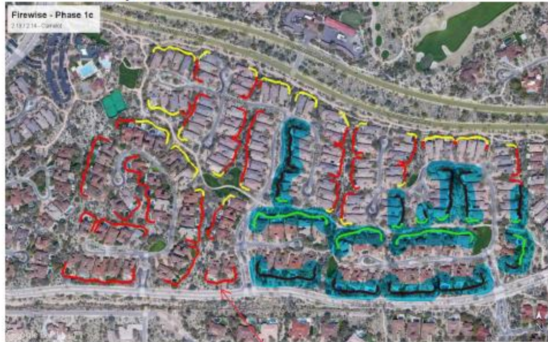
Map of Areas for Phase 1c – 2.13/2.14 - Camelot