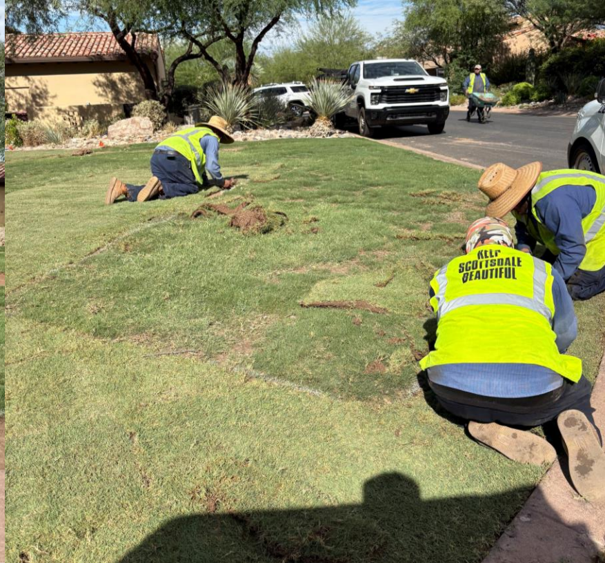
DC Ranch Landscape crews Working on sod Replacement