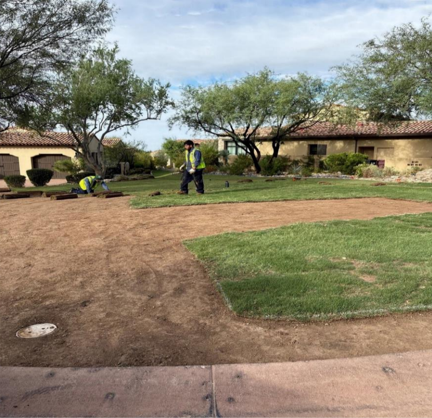
DC Ranch Landscape sod removal