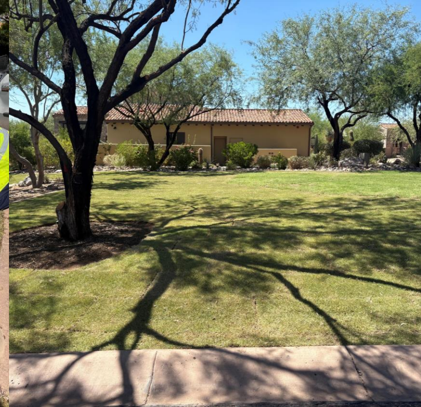
DC Ranch Landscape crews After the new sod was installed