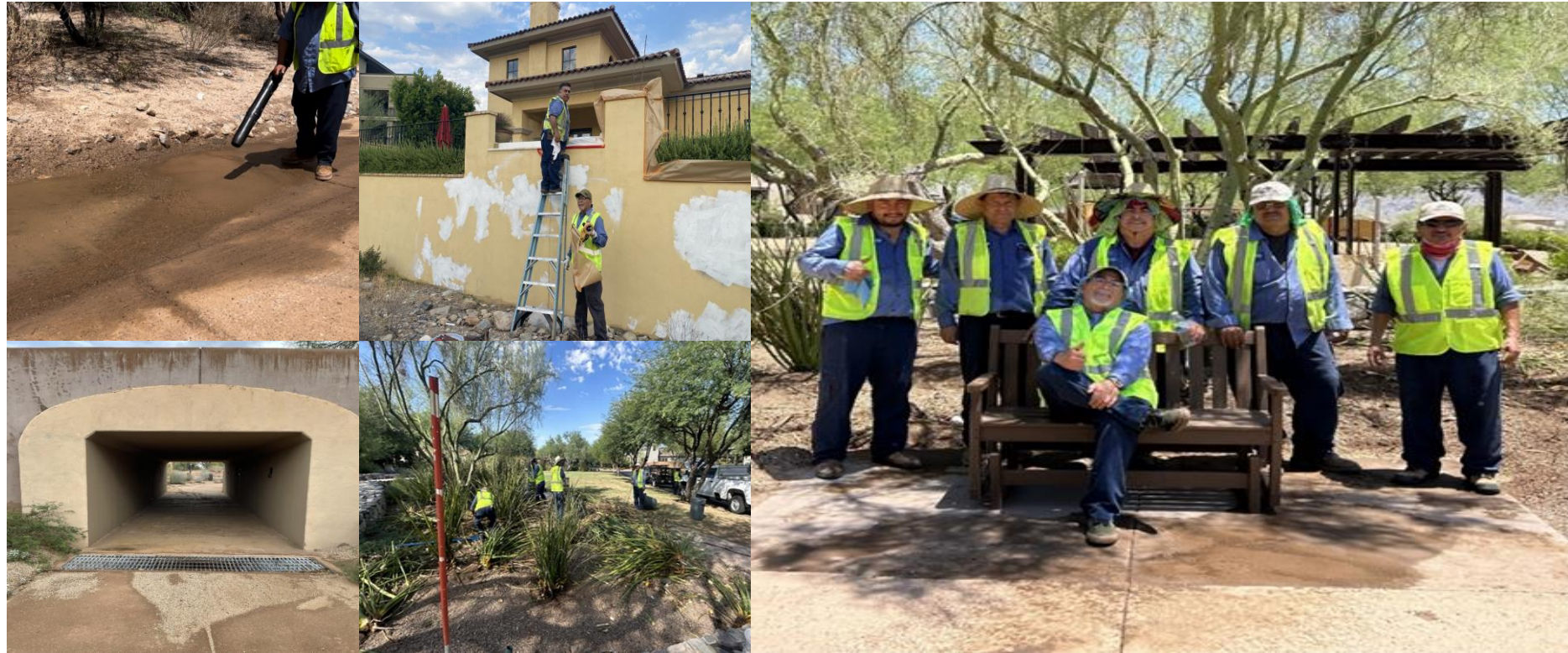
Monsoon storm cleanup – Facilities Apprentice Painters – Wasp nest removal at Desert Haciendas 1.11